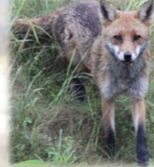
at Rhydymwyn Valley Nature Reserve