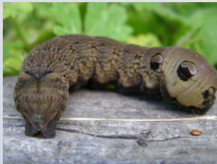
Small Elephant Hawk Moth Caterpillar

have since grown to acquire a number of wildlife reserve around North East Wales.