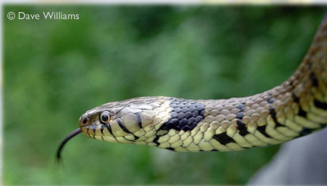
Grasssnake at Rhydymwyn Valley Nature Reserve