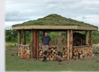
Roundhouse at ID Hooson School, Wrexham.

We do a lot of work within North East Wales with communities, schools and other organisations.