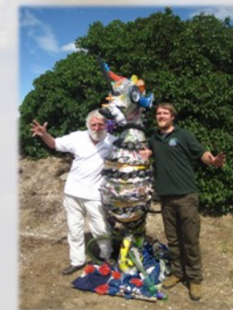
'Splashy' - our recycled seahorse sculpture at a Flintshire County Council event!