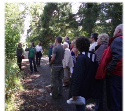
Pen Y Fron Chapel Group - Guided Walk

session in the future allowing for even more visitors to access Rhydymwyn Valley Nature Reserve.