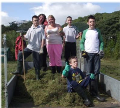
Argoed High School Students - Grassland Work

the large number of secondary school visits we have received this year. We are encouraged by the number of repeat visits and endeavour to continue developing the opportunities available for secondary school students at Rhydymwyn Valley Nature Reserve.