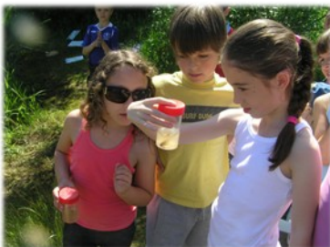
Wepre School Visit