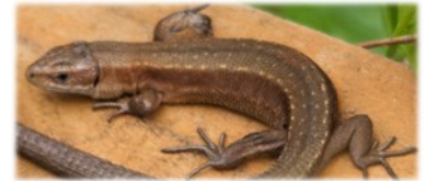
Common Lizard