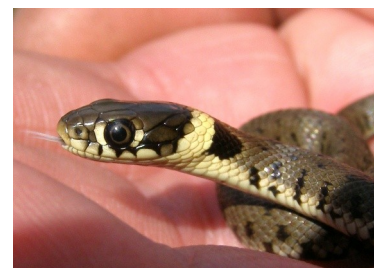
A young Grass Snake

The warm weather has helped bring the common lizards and the grass snakes out of hibernation. I was fortunate enough to