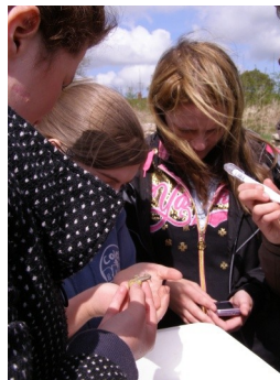
Last years Llysfasi College students counting snails.

on the banded snails that live on the reserve. The students have also been asked to design their own survey for invertebrates at the reserve so we are looking forward to seeing what they come up with.