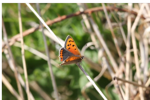
Small Copper Butterfly

Sightings of butterflies are increasing with lots of sightings of peacock, orange tip, comma, small and green veined white