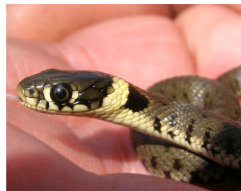
Grass Snake at Rhydymwyn

contact the office on 01352 742115 or email cweo@newwildlife.org.uk