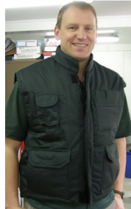
Our Ranger modelling a Gilet

There will also be some fleeces available soon - watch this space.