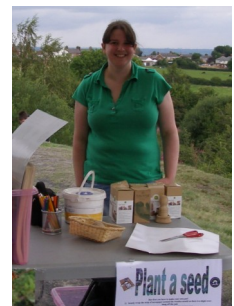
One of our volunteers manning a stall

If you are interested in helping NEWWildlife please contact us in the office on 01352 742115 or admin@newwildlife.org.uk