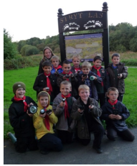
1st Johnstown Scouts Stryt Las Nature Reserve

Duabentons and Pipistrelles were seen (and heard) flying over the large lake in the park. Areas in Johnstown have been improved for wildlife and to provide better access for people. Stryt Las Park has