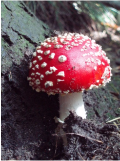
A Fly Agaric toadstall

This autumn has been excellent for fungi. Everywhere had a different species in sight. Tiny, fragile, white Crepidotus hugged the sides of rotting twigs; big, brown Birch Boletes stood proud beneath the birches and, my favourite, the lovely red and white spotted fairy toadstool ( Amanita muscaria ) was easy to spot amongst the